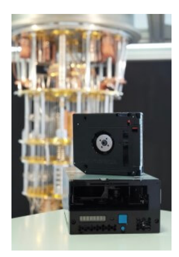
IBM Quantum Computing

IBM's commitment to Europe would extend beyond the establishment of the quantum data center. More than 60 organizations in Europe are already leveraging the IBM Quantum Network, which provides access to quantum hardware and software. Among the notable participants in this network are Bosch, the Bundeswehr University, CERN, DESY, Fraunhofer-Gesellschaft, PSNC, and T-Systems. These organizations are actively exploring the potential applications of quantum computing in diverse fields such as material research, high-energy physics, energy transition, sustainability, and finance.